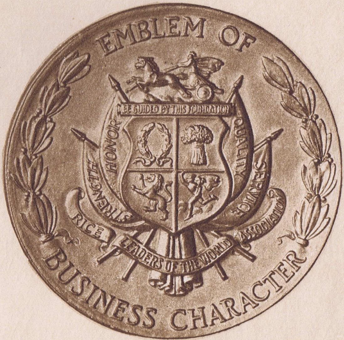
Gold Medal-Actual Size