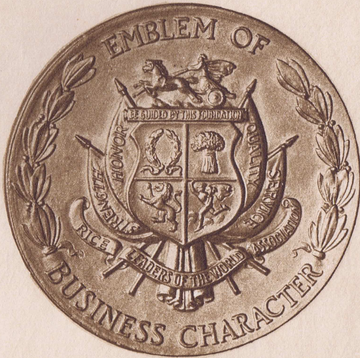
Gold Medal-Actual Size