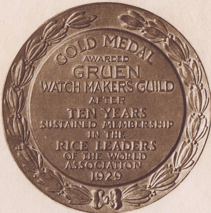
Reverse of Gold Medal