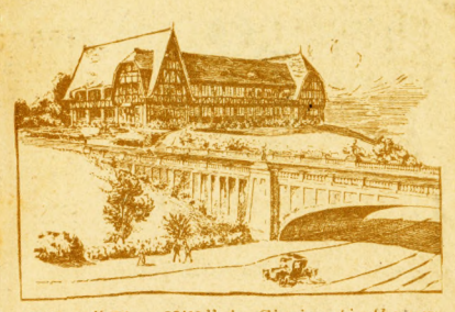
This is "Time Hill," in Cincinnati—the new American Home, service plant and case factory of the

The word "Verithin" is widely advertised and copyrighted by us—therefore when a very thin watch is asked for, it means a Gruen.