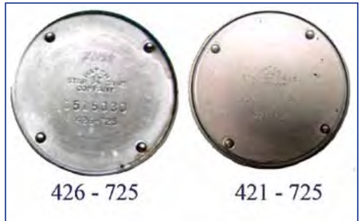
Figure 5: Submarine watch model “migration” shown in the case back

we see that it has a Style Number of 725. In the Style Caliber Table, calibers 421 and 426 are shown to the right of Style 725.