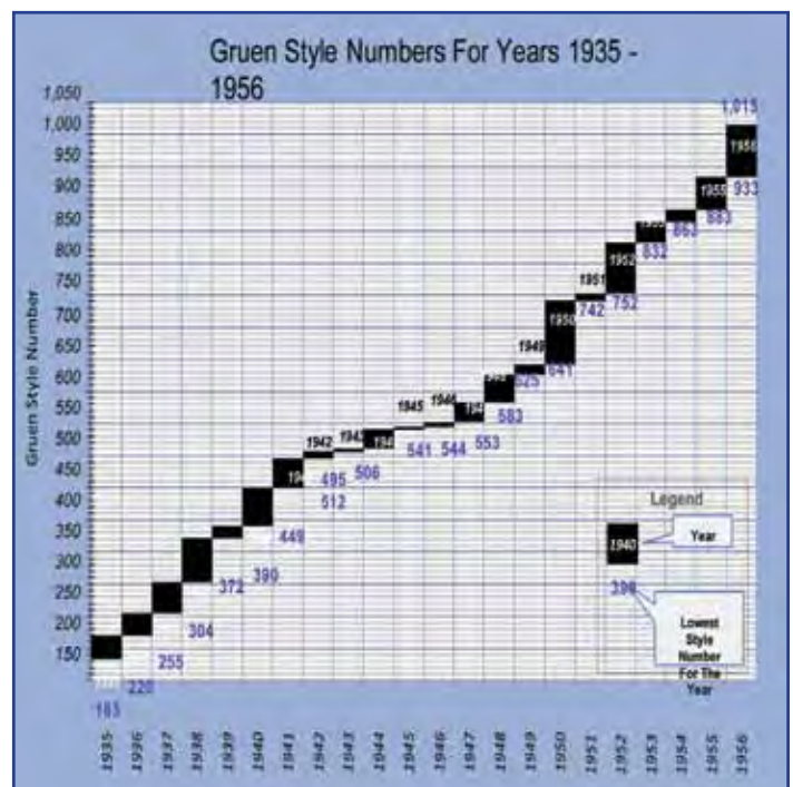
Figure 3: Style Number/Date Chart

For years in which no watches could be identified, we relied on watch crystal catalogs. These catalogs show the highest Style Number in use for the year the catalog was published. Seventeen crystal catalogs were utilized in this project including those from the GS, Rocket, and Perfit companies.