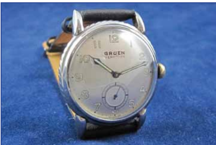
Figure 4: Gruen “Submarine” model

To help determine when Style Numbers were re-used or when a watch model shows evidence of movement migration, we developed a Style Caliber Table shown in Figure 6 by capturing data from many crystal catalogs. The first column lists each Style; the numbers to the right are the movement calibers that are used for that Style. Again, looking at the Submarine model,